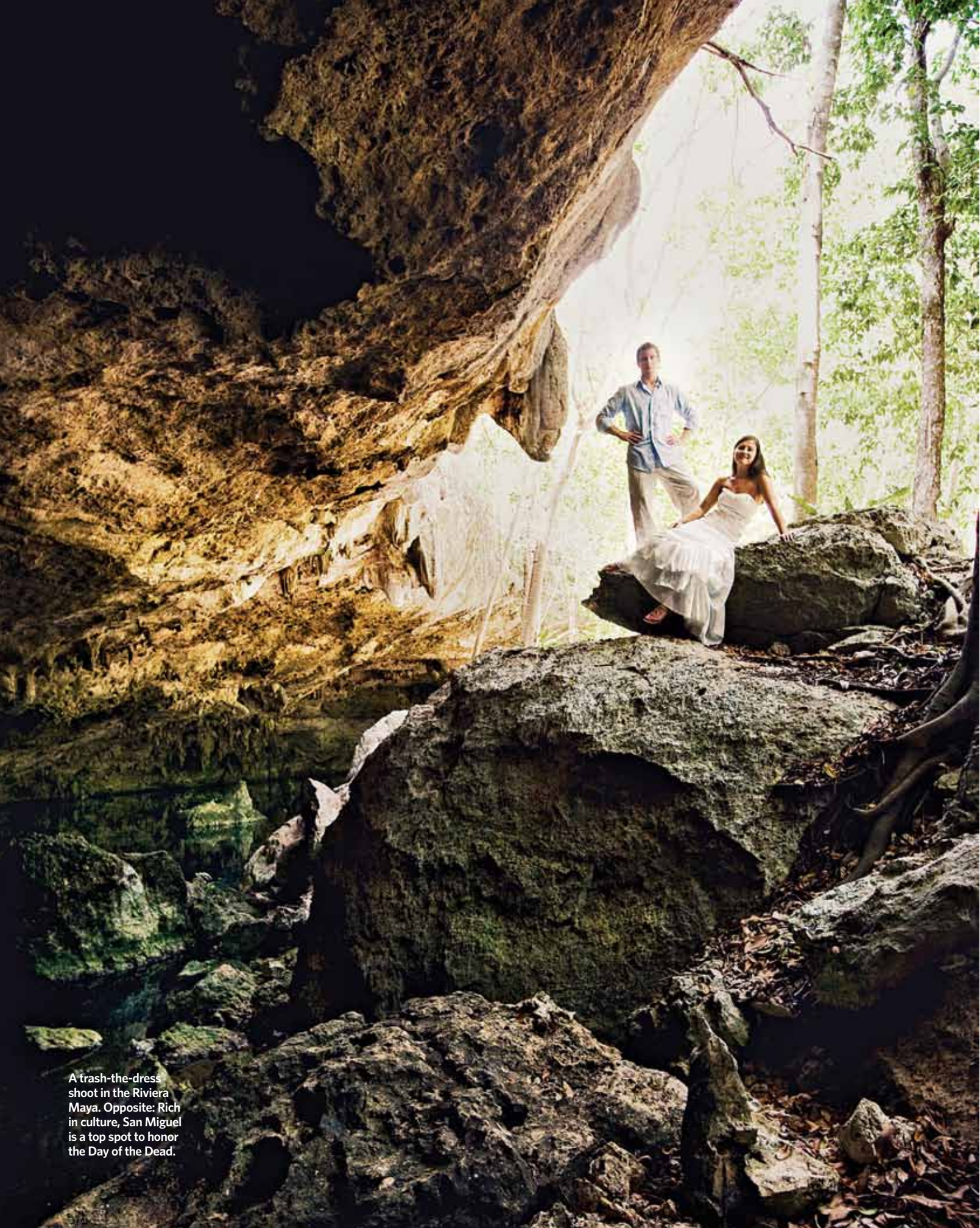
A trash-the-dress shoot in the Riviera Maya. Opposite: Rich in culture, San Miguel is a top spot to honor the Day of the Dead.